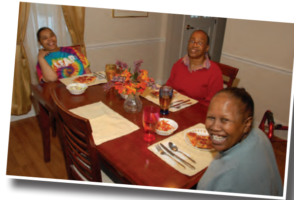
UCP of Greater Cleveland encourages individuals to be as independent as possible while tailoring services based upon individual need and preference