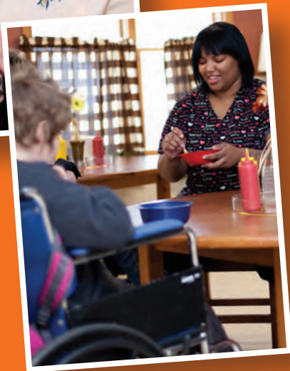
Clients complete daily tasks both independently and with support as needed