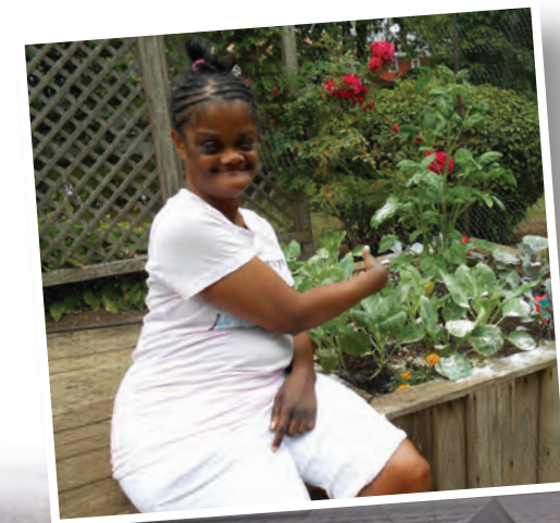
Clients are encouraged to participate in community and recreational activities on a regular basis